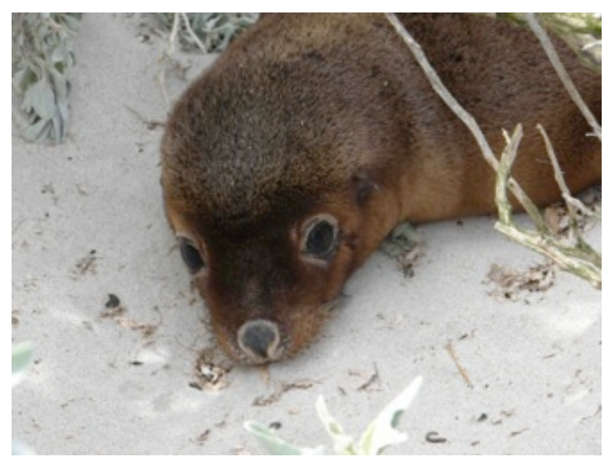
Thursday 17<sup>th</sup> October Kangaroo Island Snake Lagoon and West Bay

As we arrived back in Flinders Chase, some rain was beginning to fall. This developed and became quite heavy accompanied by gale force winds that made us very pleased to be in a warm, dry, well-insulated cabin on such a stormy night.