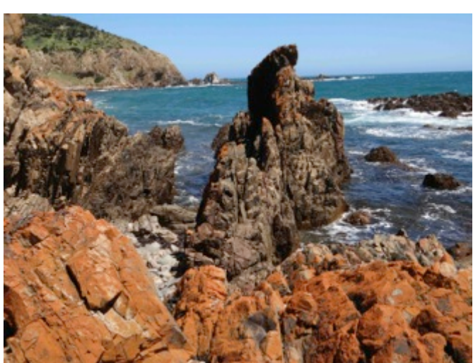
King George Beach

From there we pressed on through rolling hills (quite a contrast to the Southern side of the island). Our next stop was King George Beach. This was really a photographers dream if interested in combining rock scapes and seascapes. The Beach though contained no sand — purely billions of rounded and carefully polished stones stood over by vertical jagged columns of sedimentary rocks tinted with bright orange algae. Amongst the array of flotsam that had been swept ashore was a coconut and we speculated about where it may have come from.