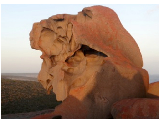
The Remarkables glow in the late sunlight

Our intended destination was to be at the Remarkables for sunset and to have our Happy Hour there. Su packed wineglasses and wine along with a full range of nibbles for the occasion. I was anticipating that with the weather conditions we would have to share the site with countless people. However they were all obviously not keen to be driving after dark and abandoned the rock to just we three and three OS tourists. It was a much more inspiring view than our previous visit a few days earlier and I snapped away 52 images.