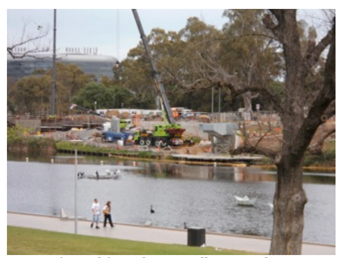
Transformed from the normally tranquil Torrens

I must confess that my impressions of Adelaide was that it was a huge construction site. The largest construction seemed to be around the river with cricket ground, convention centre and work along and across the River Torrens. I had expected to see a serene scene over the river and a city that had an air of stability. Instead I encountered large areas fenced off for enormous new constructions. There were dozens of cranes on the skyline. Even Rundle Mall being torn up. Even at the recently remodelled Airport terminal precinct we had to run the gauntlet through new works . However it is shaping up to become a very attractive open entrée to Adelaide. .