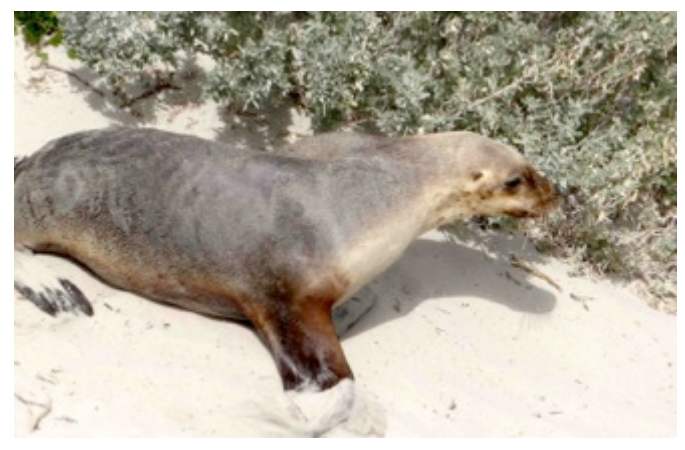
For Sooky Sea-Lion the warm dry sand is like a throne

Sookey went ashore and tried Loney's trick. It worked. And soon every sea-lion in the colony was talking to and respecting Sookey. She became the queen of the colony and lived in the driest warmest part of the beach whenever she was ashore.