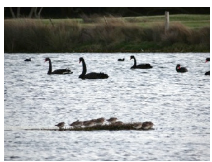
Lake Victoria late afternoon

Back in the warmth of Rosalind's home we enjoyed desert and saw the amazing images of African wildlife captured by ULN during his recent adventures there.